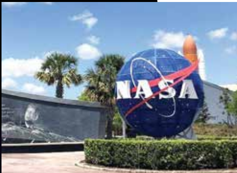
Kennedy Space Center Visitor Complex