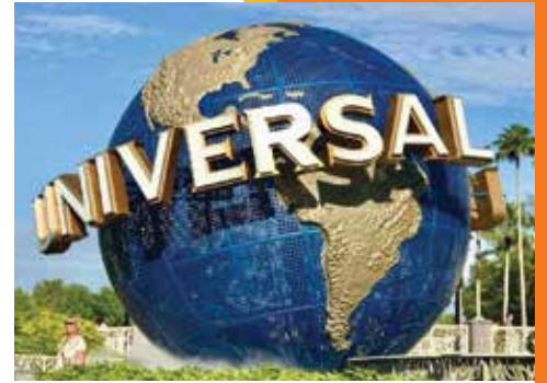
Universal Orlando Resort™