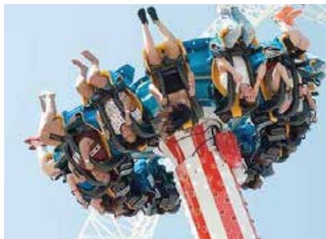
Fun Spot America