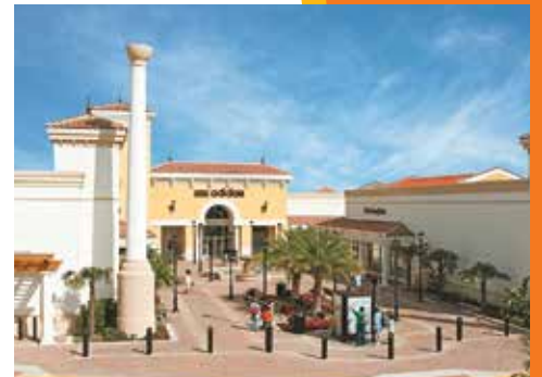
Orlando International Premium Outlets