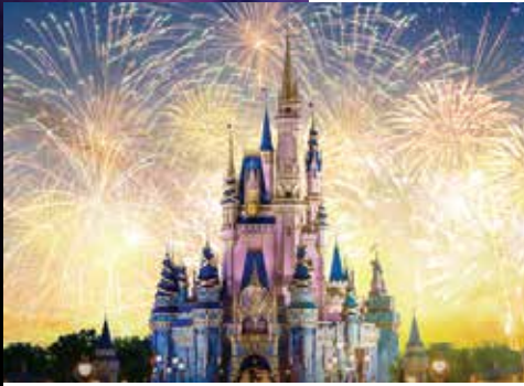
World Disney World® Resort